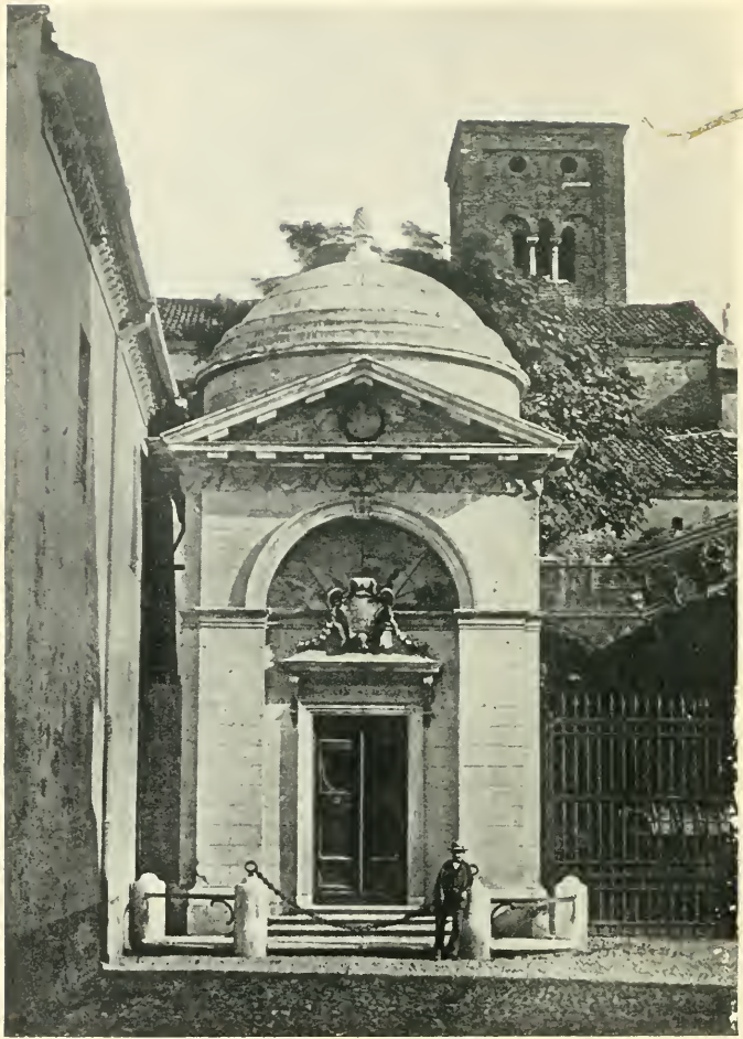
TOMB OF DANTE AT RAVENNA.